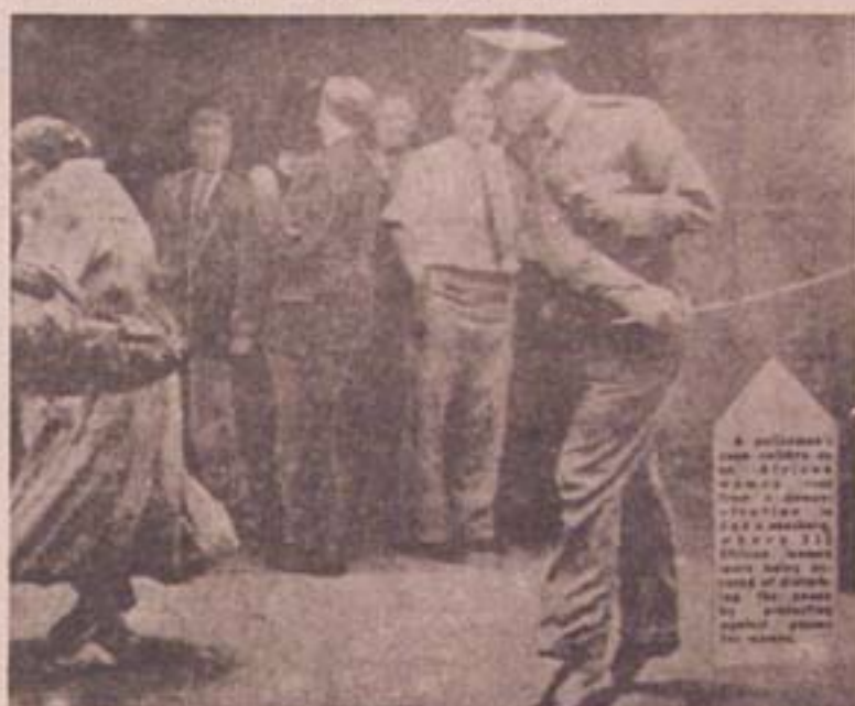
A White South African policeman's cane swishes as an African woman runs from a demonstration in Johannesburg, where African women were being accused of disturbing the peace.

Turning now to the situation of African women in employment, there are no recent figures available to show the exact number of African women employed. How-