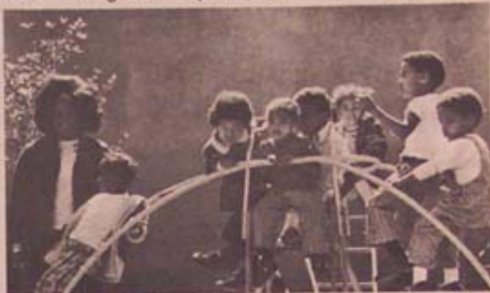
Children of the Norma Gist Free Child Development Program at play.

The skit portrayed how the unity of the community repaired