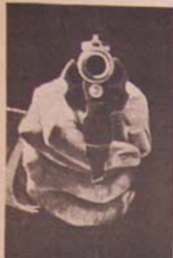
The Chicago "Beat" Program puts a gun to the head of poor and oppressed people.