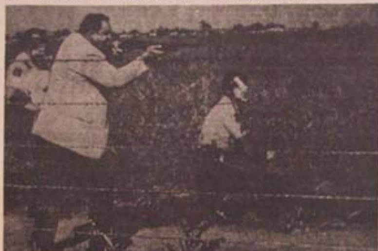
Sheriff deputies ordering armed White vigilantes to surrender.

A resolution was adopted to boycott Coca Cola if necessary since it refuses to bargain in good faith in discussing wages. The Utrillo Ranch in Florida (growers of citrus fruits for Minute Maid), which has an 80% Black and 20% White and Puerto Rican work force, is the cause of the UFW threatened boycott. □