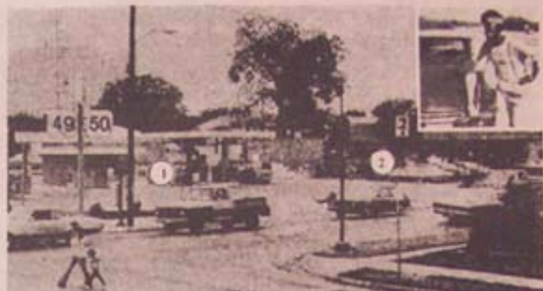
(1.) The service station where EMMANUEL OLATUNJI (inset) was murdered. (2.) The 7-Eleven store where the robbery occurred.

Customers at the robbed 7-11 Market directed police to the service station because they heard car tires squeal and "assumed" the car had something to do with the robbery. The