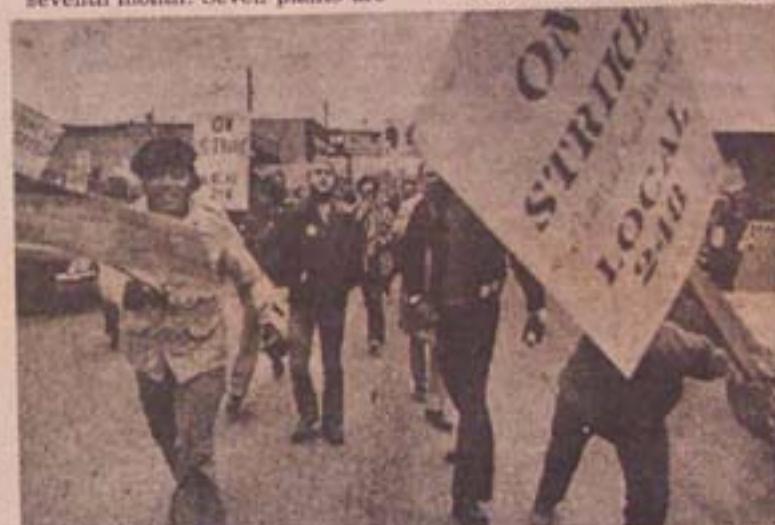
Picketing meatcutters of Local 248 outside the Northern Packing Company in Milwaukee, Wisconsin.