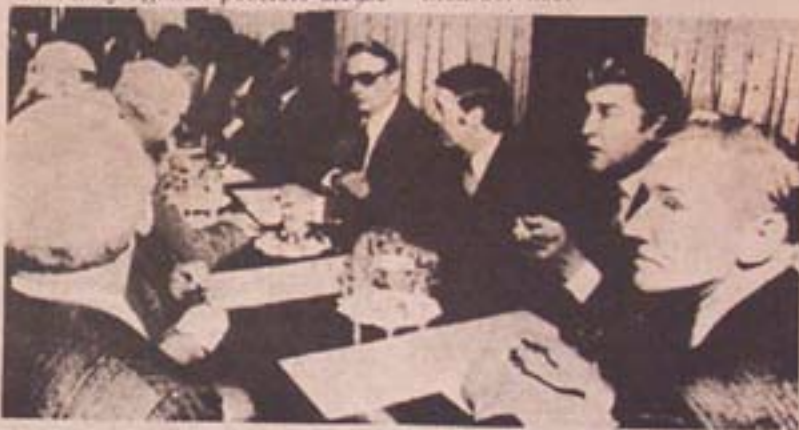
The Victoria Falls meeting between Zimbabwean liberation groups, including ZANU, and the White supremacist IAN SMITH regime (above) collapsed as predicted. ZANU has continued to call for persistent armed struggle to liberate its homeland.

7. Access to all ZANU documents, papers and other evidence confiscated by the Zambian government must be made available to the accused ZANU members so they may adequately prepare their defense.