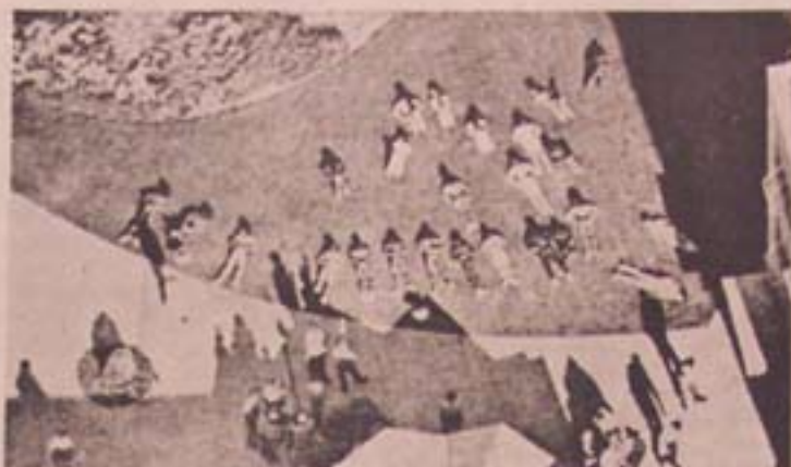
Aerial photo of Adjustment Center courtyard after August 21, 1971, incident. The first tier inmates were forced to strip naked, handcuffed and hogtied, and were brutalized with billy clubs and burned with cigarettes for hours.