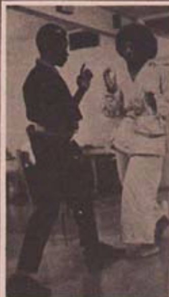
FREE TO THE COMMUNITY