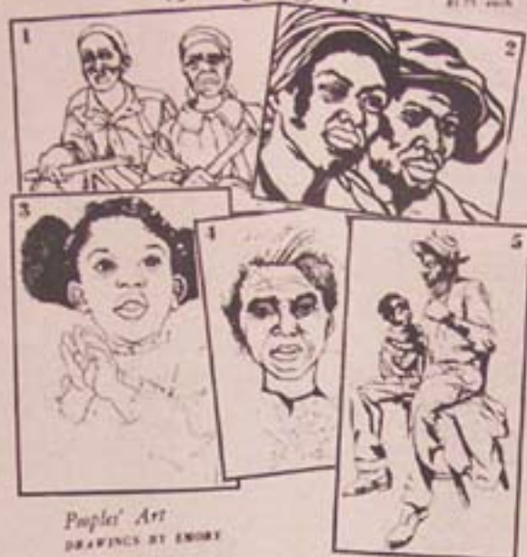
People's Art DRAWINGS BY EMORY

OUTSIDE UNITED STATES: $4.00 per package $1.75 each