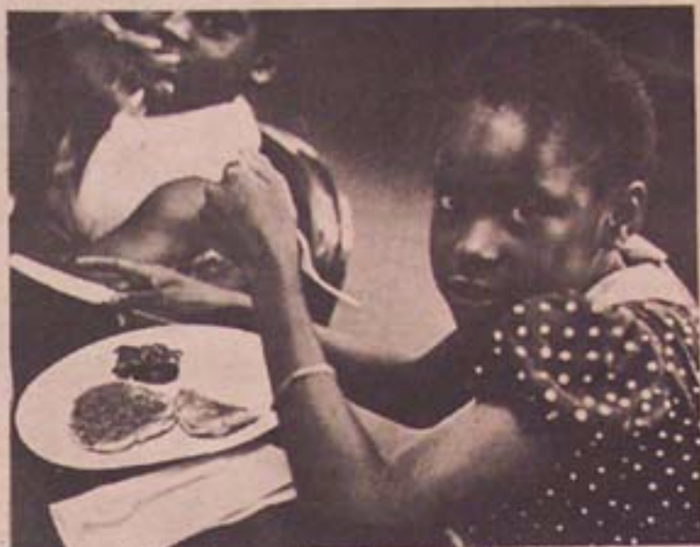
Black Panther Party Free Breakfast Program

The organized Black press is concerned about advertising revenue being siphoned off from the Black-owned press to these White-owned ventures which would seriously threaten the