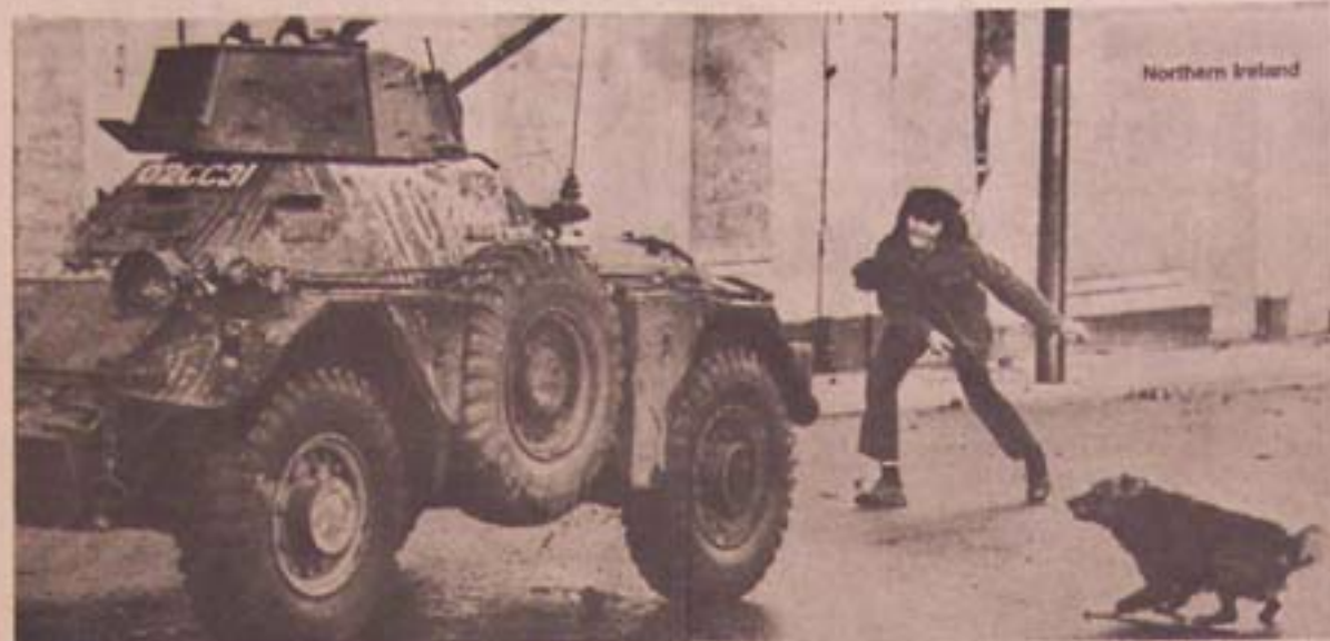
A Catholic youth in Northern Ireland throwing rocks at a passing British armored car. "The relevance and importance of an armed struggle against imperialism lies not in bravado and military adventurism... but in its firm and solid base in the will of the people."