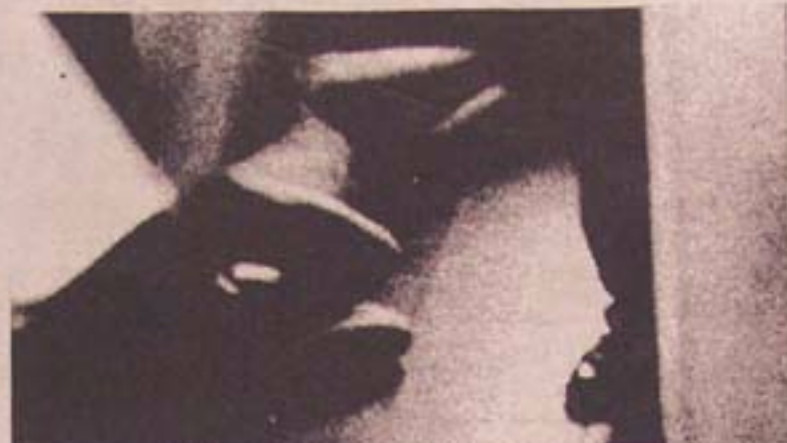
Missouri prisoner in a "strip cell."