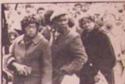
LIST 1010 $1. The Black Panther Party

Supplement to the Whole Earth Catalog The CoEVOLUTION Quarterly