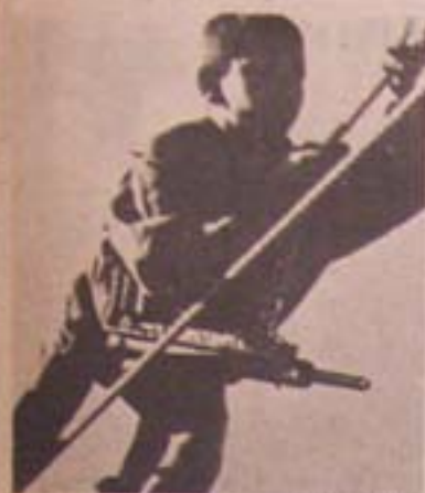
Future Palestinian guerrilla fighter in training.

(Beirut, Lebanon) - Palestinian revolutionaries launched a series of operations in the Israeli occupied territory recently, inflicting losses on the enemy in men and material, the Palestine news agency Wafa reports.